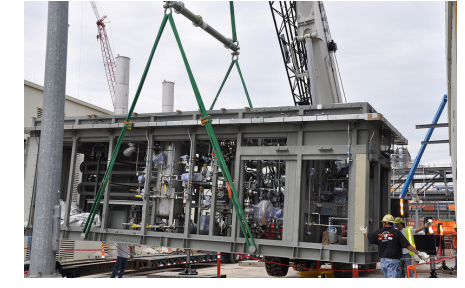
A neutralization module for the treatment of hydrolysate is guided into the SCWO Building.