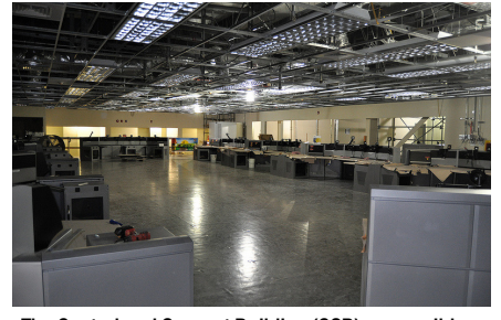
The Control and Support Building (CSB) responsible for operating the plant takes shape.