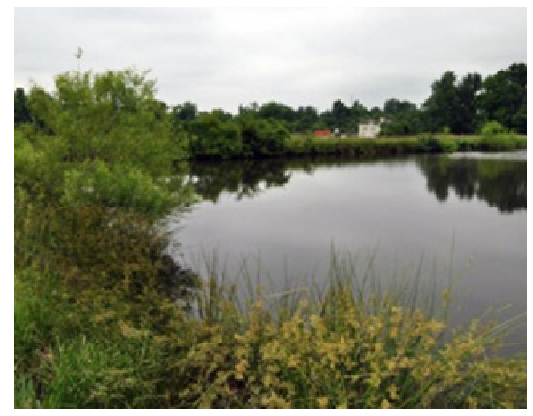
The TNT washout lagoons before remediation.

On June 3, 2013, a groundbreaking ceremony took place at the TNT Washout Lagoon at the Blue Grass Army Depot (BGAD).