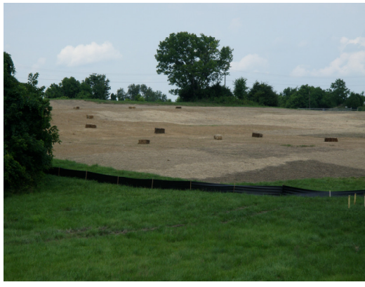
Hay applied to former lagoon area to encourage grass growth.

In attendance at the ceremony were representatives from BGAD; Kentucky Division of Waste Management's Permitting, Corrective Action, and Field Operations Branches; U.S. Army Corps of Engineers; and Military Project Management.