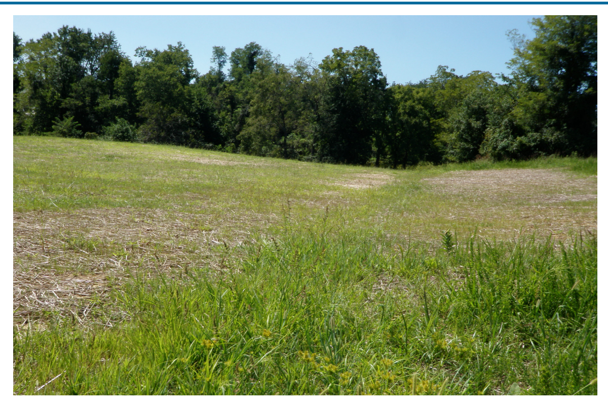
Recent photo of TNT Washout Lagoon remediation area