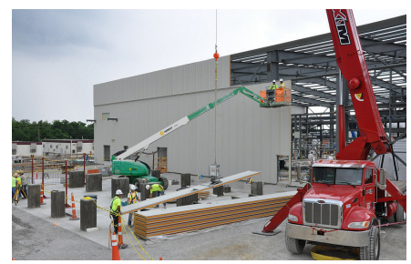
The Supercritical Water Oxidation (SCWO) Building receives siding .