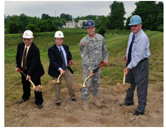
Coordinating agencies break ground with golden shovels.

These plans will now be put into place, as the ceremony marked the beginning of Phase II, occurring just a few months before Colonel Rogers' retirement and the appointment of Colonel Lee Hudson as BGAD commander. The physical cleanup work should be completed in 2013, with the required permit modification work completed by early 2015.