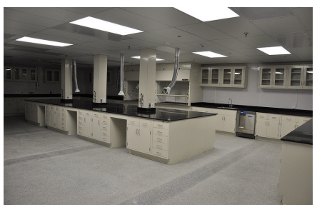
The lab where agent neutralization will be confirmed completed systemization in July.